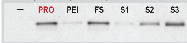
Figure 1: Achieve high antibody titers using the TransIT-PRO ™ Transfection Kit. Human IgG1 was produced by transient transfection using TransIT-PRO and PRO Boost Reagent (1:1:1) (Mirus Bio, Madison, WI), 25 kDa linear PEI (6:1) (Polysciences, Warrington, PA), or FreeStyle ™ Max (1:1) (Life Technologies Corporation, Carlsbad, CA) transfection reagents according to the manufacturers or published protocol (reagent:DNA ratio). Transfections were performed using 1 µg plasmid DNA per milliliter of culture and 0.5 x 10 6 cells/mL at the time of transfection. FreeStyle ™ CHO-S cells were cultured in 20mL of FreeStyle ™ CHO Expression medium (Life Technologies Corporation, Carlsbad, CA) in 125 ml shake flasks. Day 7 supernatants were clarified and analyzed by Western blot. An IgG standard was included for quantification estimate (S3 = 6.3 mg/L, S2= 3.2 mg/L, S1= 1.6 mg/L).

medium, BD Select ™ CHO medium, FreeStyle CHO expression medium, PowerCHO ® 2 CD medium, and ProCHO ™ 5 medium. Cells adapted to the appropriate media were transfected with a plasmid encoding a human IgG1 antibody construct using multiple transfection methods including: TransIT-PRO transfection kit, 25-kDa linear PEI, and FreeStyle Max transfection reagent (Figure 2). Clarified supernatants were analyzed using a human IgG-Fc sandwich ELISA. The media formulation impacted transfection efficiencies by >10-fold within a given transfection methodology.